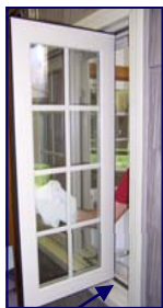
Clean easily and conveniently from the interior of your home