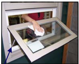
Open sash completely

When closing and locking your Ovation casement or awning window, ensure that the sash is seated completely on the frame before locking.